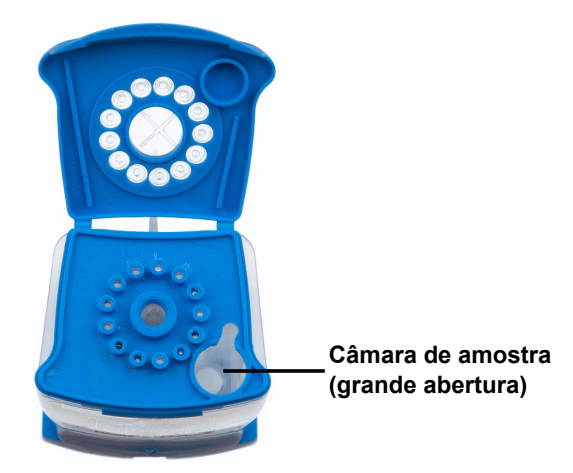
Figure 5. Xpert Xpress SARS-CoV-2 Cartridge (Top View)