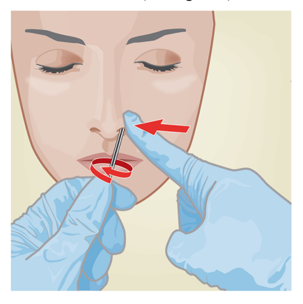
Figure 2. Nasal Swab Collection for First Nostril

1. Insert a nasal swab 1 to 1.5 cm into a nostril. Rotate the swab against the inside of the nostril for 3 seconds while applying pressure with a finger to the outside of the nostril (see Figure 2).