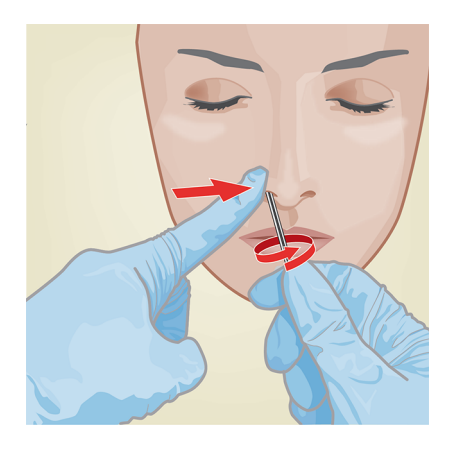
Figure 3. Nasal Swab Collection for Second Nostril

3. Remove and place the swab into the tube containing 3 mL of viral transport medium or 3 mL of saline. Break swab at the indicated break line and cap the specimen collection tube tightly.